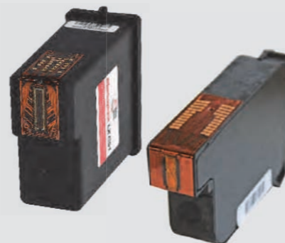
LX and HP cartridge Dual channel jet technology ensures perfect print quality