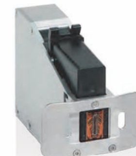
LX printhead (model 1)