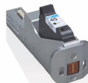
HP printhead (model 1)