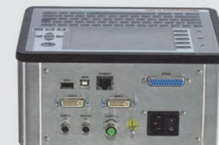
Ethernet Interface Data transfer from networks and access via web interface