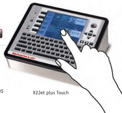
X2Jet plus Touch